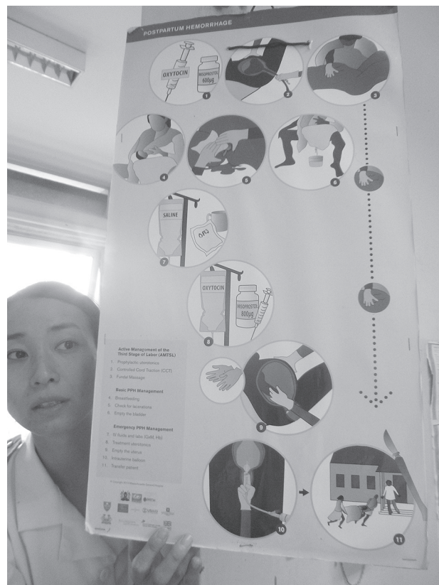
Figure 4. Danger sign of postnatal hemorrhage

At the start of the volunteer work, it was difficult to communicate with colleagues because of the language barrier. Thus, the initial activity was observing the situation at MNH. At the labor ward, many pregnant women were afraid of labor pain and they did not know the various danger signs to look for and tell the nurses. The first step was demonstrating Japanese midwifery