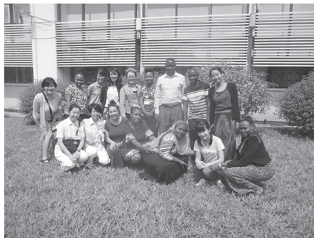
Figure 7. MUHAS professors and master’s students

One of the strengths of the JICA course is long-term volunteer activity for 1 year and 9 months. This enables greater interaction and understanding among people with different backgrounds who work together. Another strength of the JICA course is the strong support from highly educated human resources composed of master’s students spearheading the volunteer activity. The highly educated human resources, which include the academic staff of Muhimbili University of Health and Allied Science (MUHAS) located in the same area as that of MNH, have provided excellent support to the MSJC particularly in their research activities (Figure 7). Thus, the evidenced-based practice and the highly educated human resources work