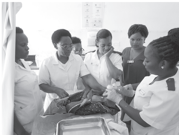
Figure 6. Neonatal resuscitation training

local nurse colleagues agreed with me that “It’s nice. I heard it was recommended globally” in our discussion about good midwifery care, they did not do the recommendations routinely. This does not mean that Japanese nurses are better than Tanzanian nurses. They are equally respected for following reasons: they have nursing senses about delivery and they take appropriate actions spontaneously without relying on data alone; they have good relationships with their family, colleagues, relatives, and patients; and they kindly accept people who have different ideas. One of the reasons why they are not able to implement the care which they believe is good for the patient is the hard working environment. They consider patients as equal in their own way. Their process of understanding and respecting their patients is their way of enhancing each other. This makes it possible to have an overlap with our concept of care.