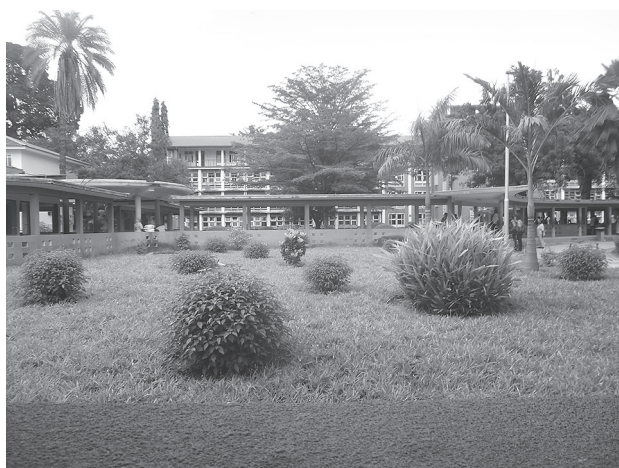
Figure 3. Muhimbili National Hospital