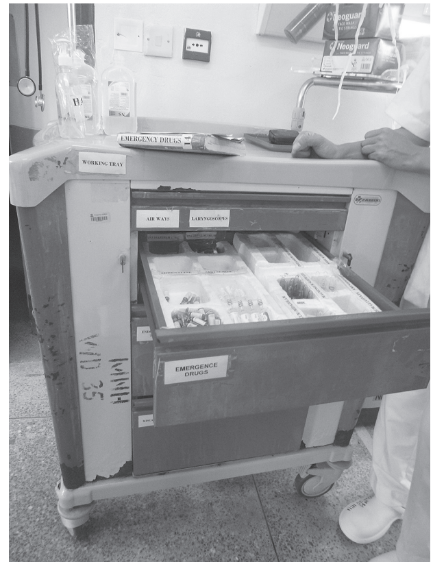
Figure 5. Emergency trolley

‘At one antenatal and postnatal ward, emergency drugs were placed in the shelf which was locked. I suggested to change the storage place because it was not useful in emergency situations. However, a colleague was strongly against my suggestion. She said that if we