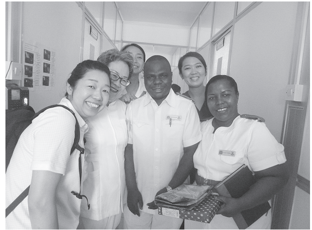
Figure 2. MNH Nursing Director and Deputy Nursing Director

This international collaboration practice is the only chance for engaging in interaction activities between master's students in the JICA course (MSJC). It provides MSJC before dispatch provision and preparation of the activities through this practice. It also gives them an opportunity to see the real medical situation in Tanzania. MSJC who have been working in Tanzania are given the opportunities to express the difficulties and